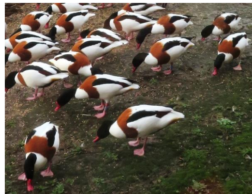
On the left, there are four birds to be identified

Remember, the Bird Watching group is still looking for a new organiser. If you feel this is a role that you could perform, please get in touch using groups@poyntonu3a.org.uk .